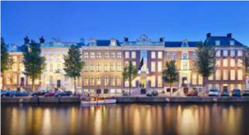
Waldorf Astoria Amsterdam