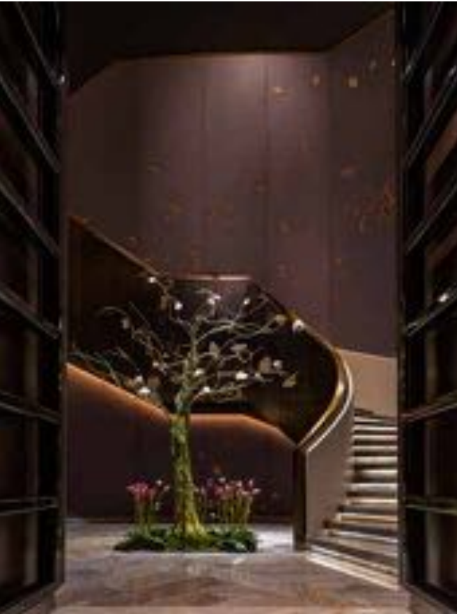
Waldorf Astoria Beijing