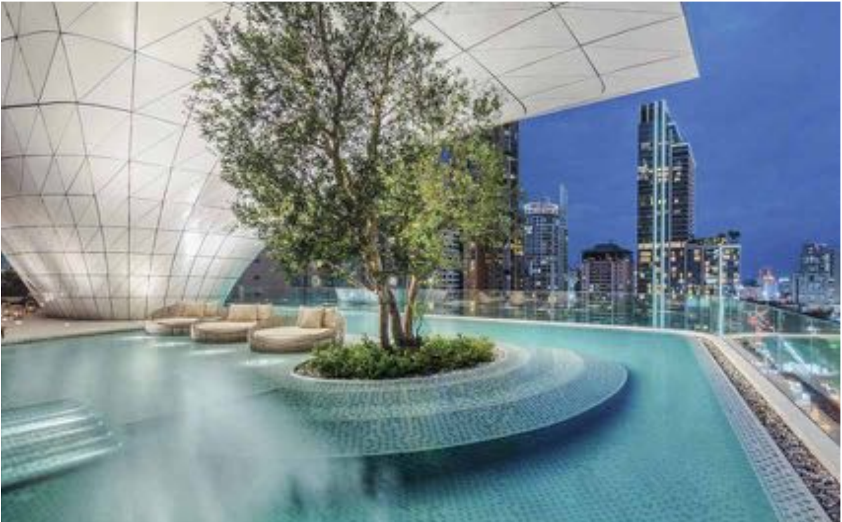
Waldorf Astoria Bangkok