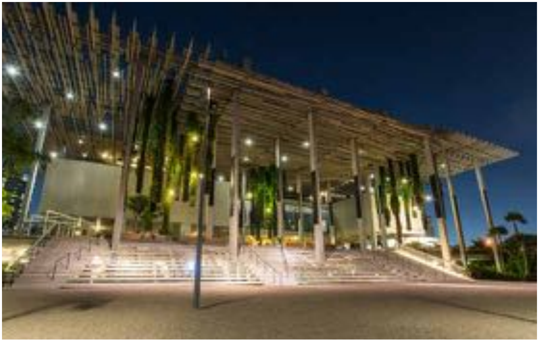
Pérez Art Museum Miami