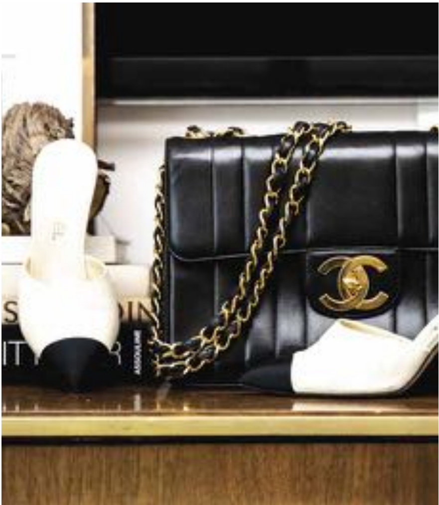
Miami Design District