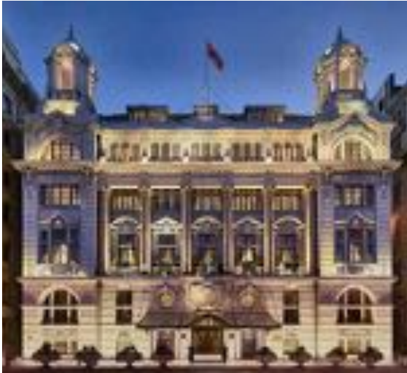
Waldorf Astoria Shanghai on the Bund

Offering exceptional experiences at one of the world's most legendary hotel brands, each Waldorf Astoria represents a unique personality with undeniable global presence and relevance.