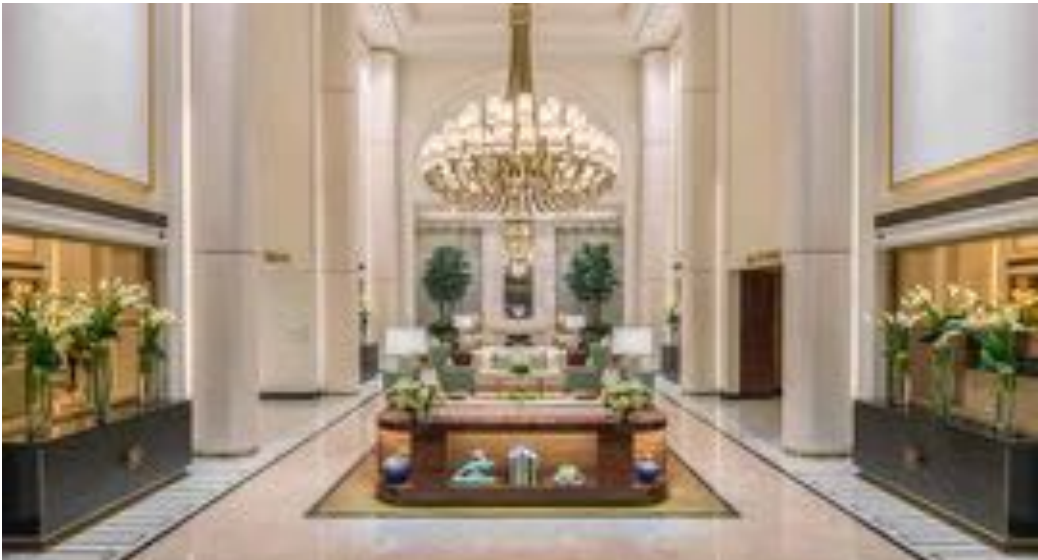
Waldorf Astoria Beverly Hills