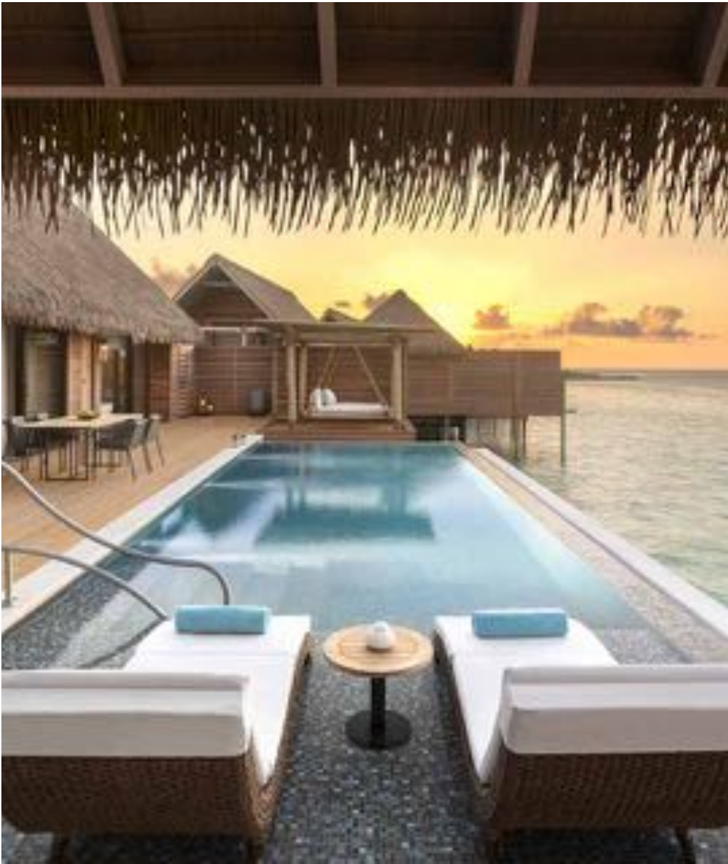
Waldorf Astoria Maldives Ithaafushi