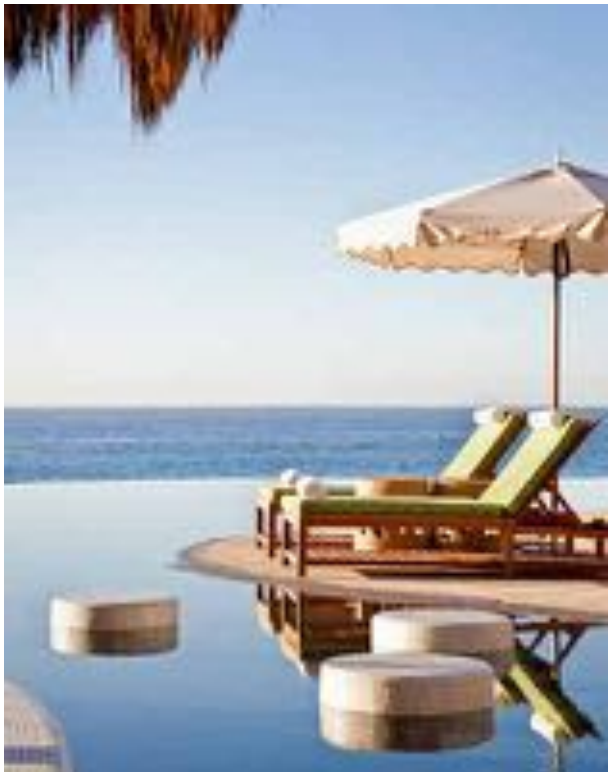
Waldorf Astoria Los Cabos Pedregal