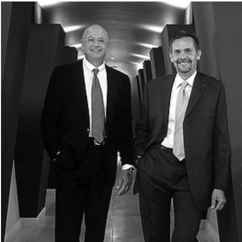
Sieger Suarez ARCHITECTURAL PARTNERSHIP