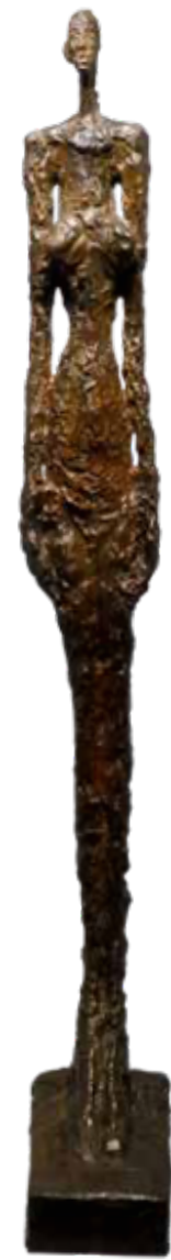
Standing Woman 1958

“The form is always the measure of the obsession.”