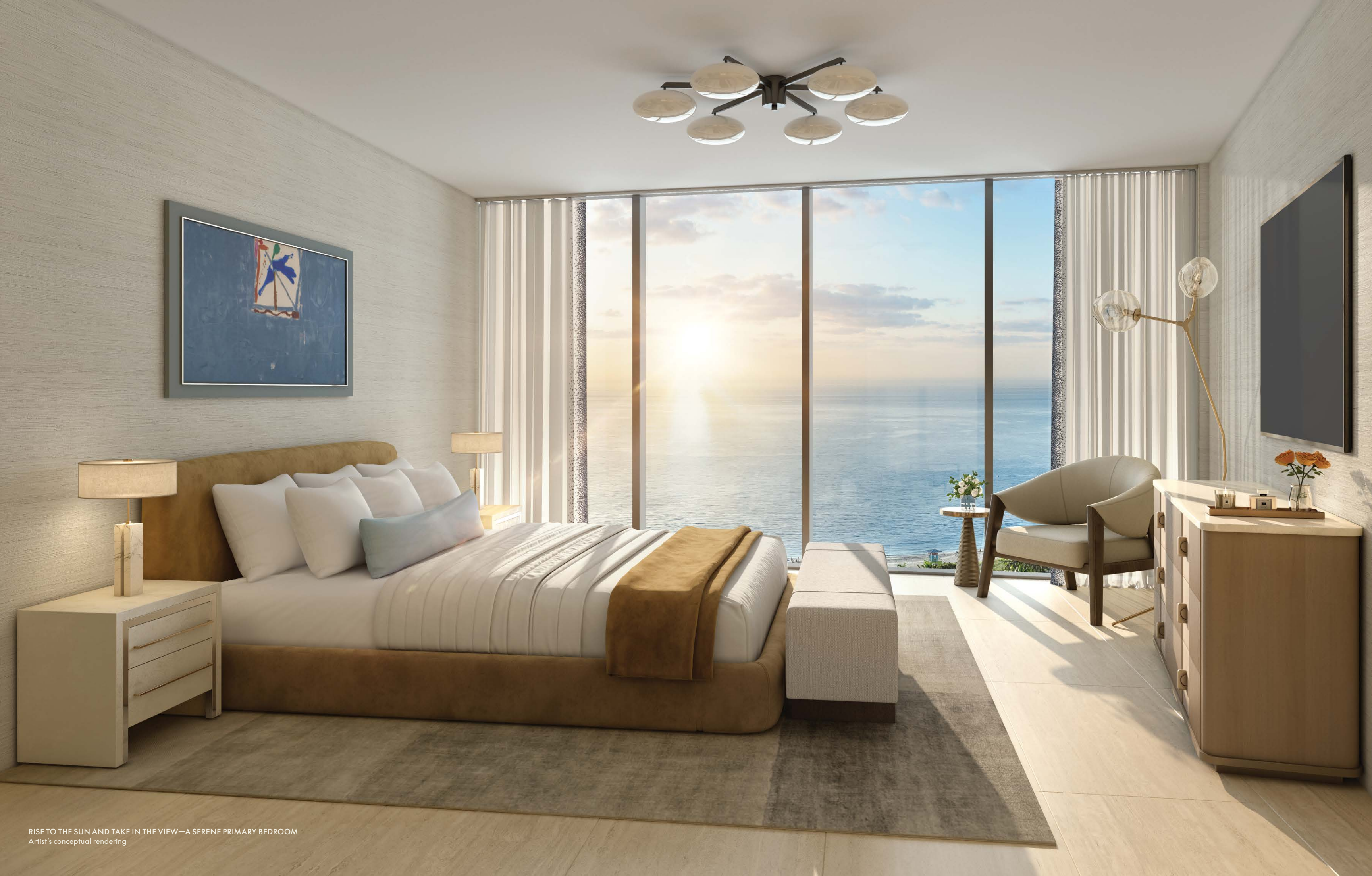
RISE TO THE SUN AND TAKE IN THE VIEW—A SERENE PRIMARY BEDROOM Artist's conceptual rendering