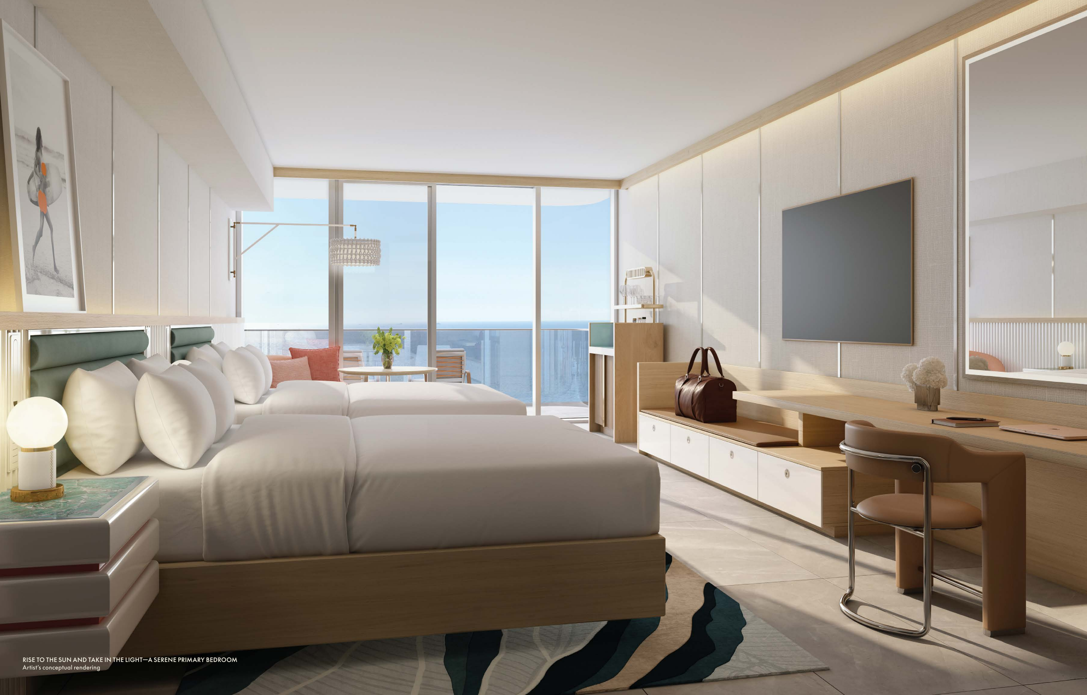
RISE TO THE SUN AND TAKE IN THE LIGHT—A SERENE PRIMARY BEDROOM Artist's conceptual rendering