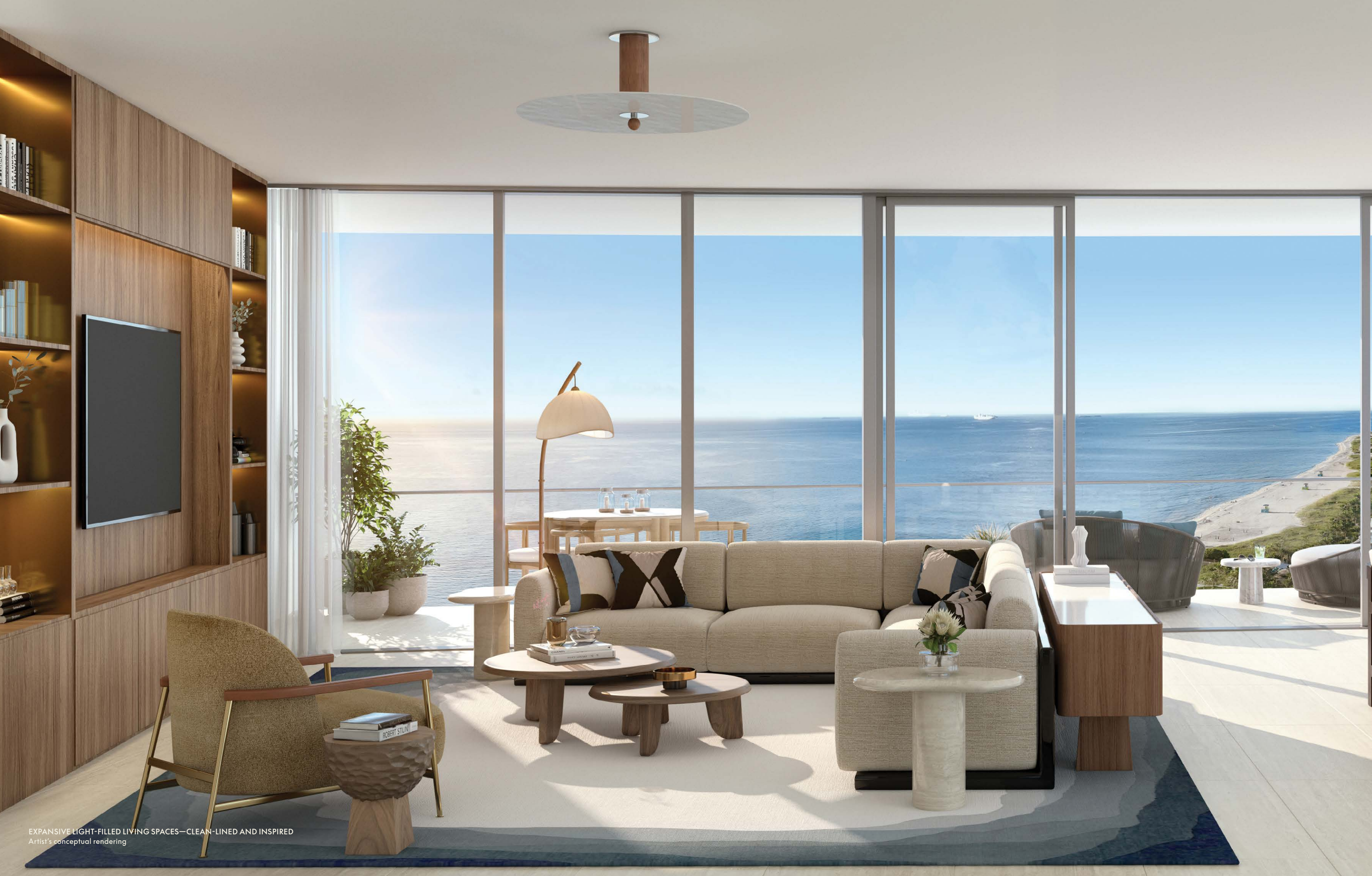
EXPANSIVE LIGHT-FILLED LIVING SPACES—CLEAN-LINED AND INSPIRED Artist's conceptual rendering