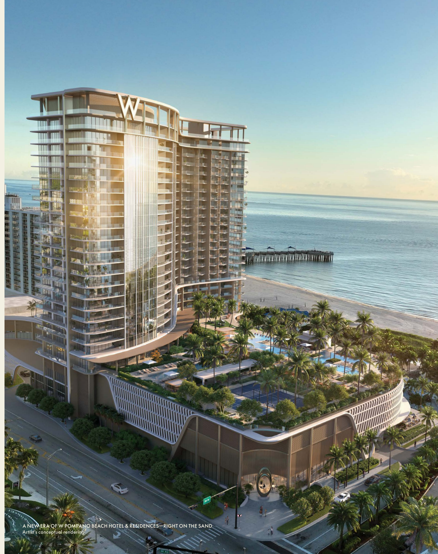
A NEW ERA OF W POMPAÑO BEACH HOTEL & RESIDENCES—RIGHT ON THE SAND Artist's conceptual rendering

*Some of the foregoing may be offered for an added cost.