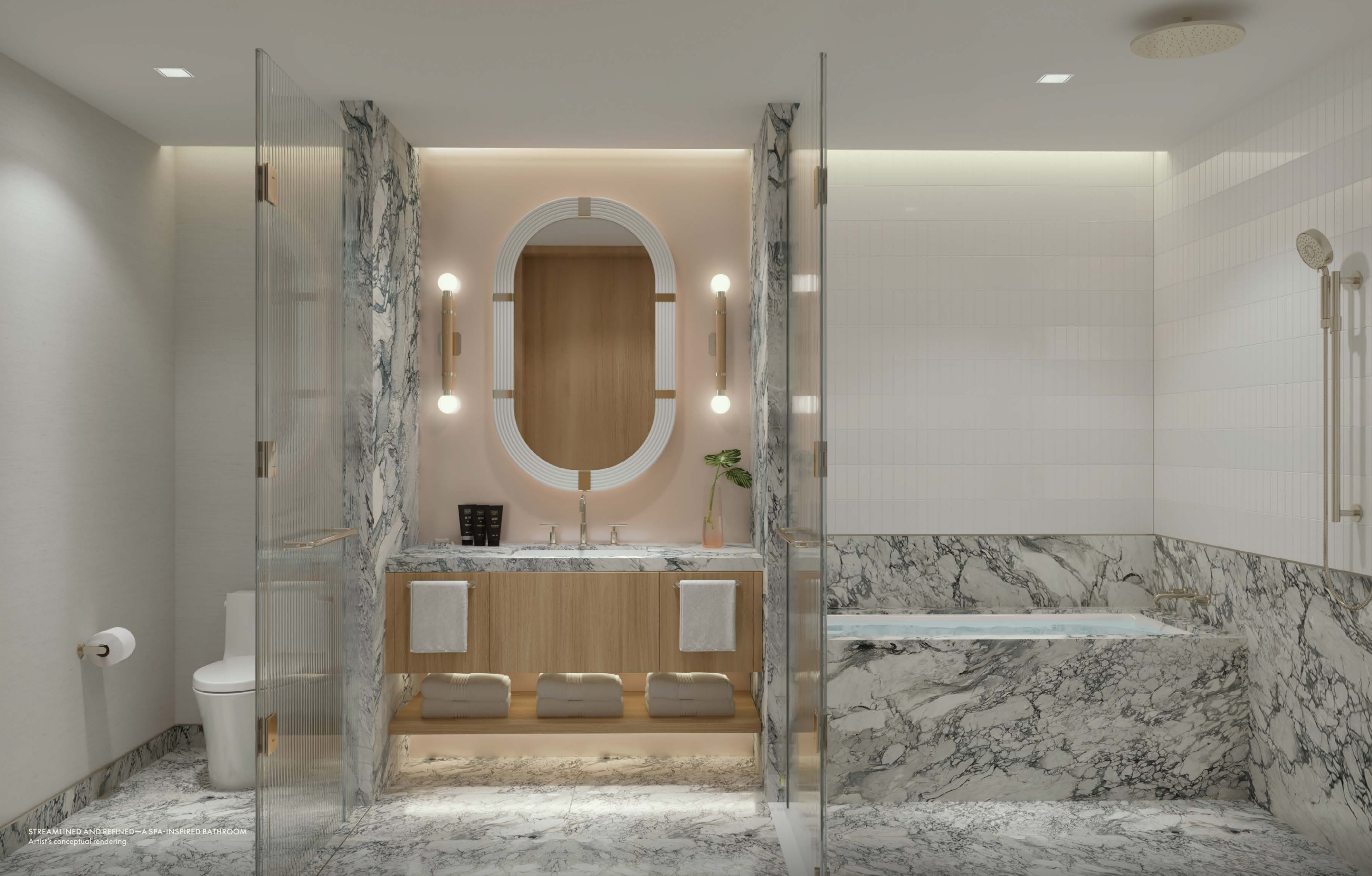
STREAMLINED AND REFINED—A SPA-INSPIRED BATHROOM Artist's conceptual rendering