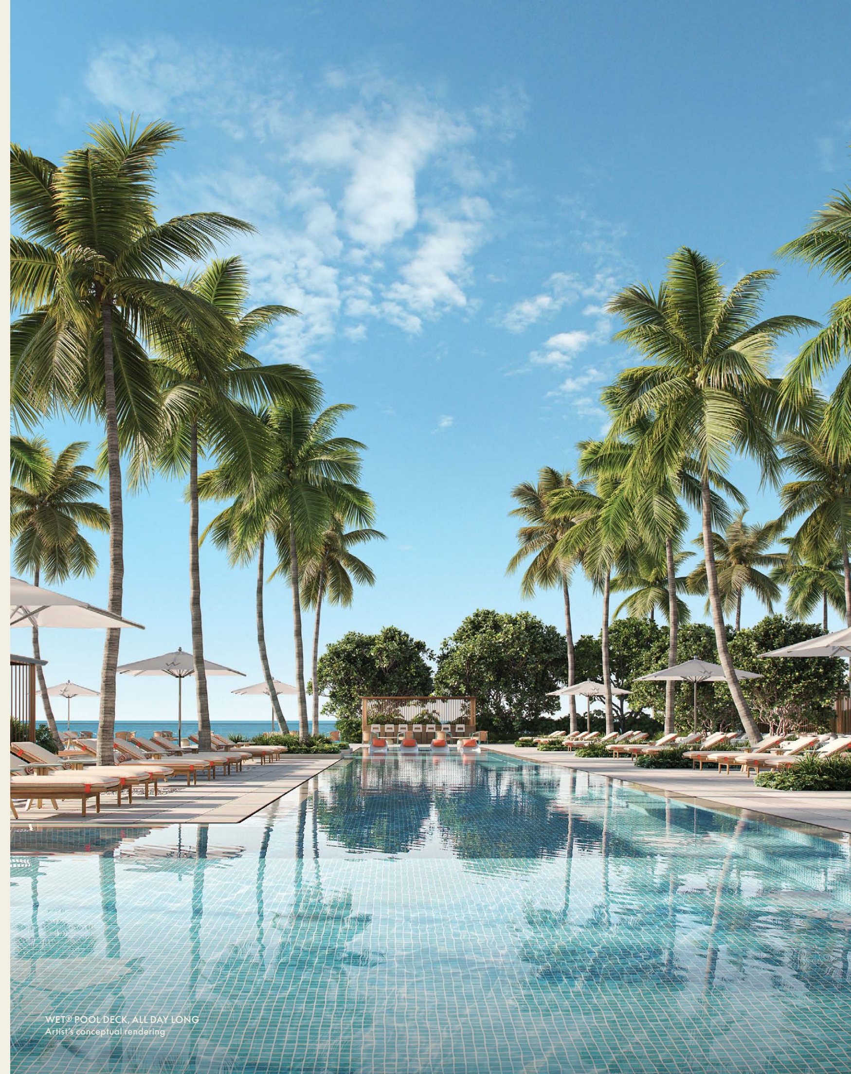
WET® POOL DECK, ALL DAY LONG Artist's conceptual rendering