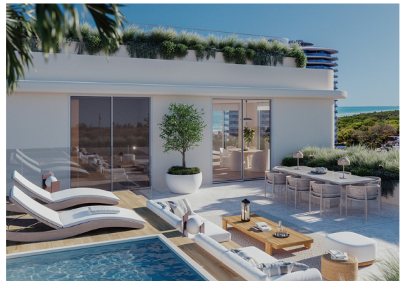
PRIVATE ROOF TOP TERRACE