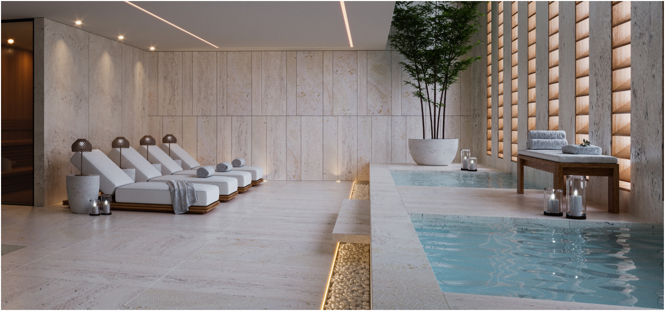
WELLNESS & SPA