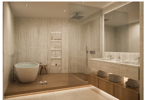
EN SUITE PRIMARY BATHROOM

One-to three-bedroom residences, most with an additional den, offer beautifully crafted interiors featuring chef-inspired kitchens. Thoughtfully designed for both privacy and effortless entertaining, these homes offer a perfect balance of comfort and connection. Residents can enjoy spacious balconies and select rooftop terraces, with optional features such as plunge pools, summer kitchens, and luxury curated furnishings packages by RH.