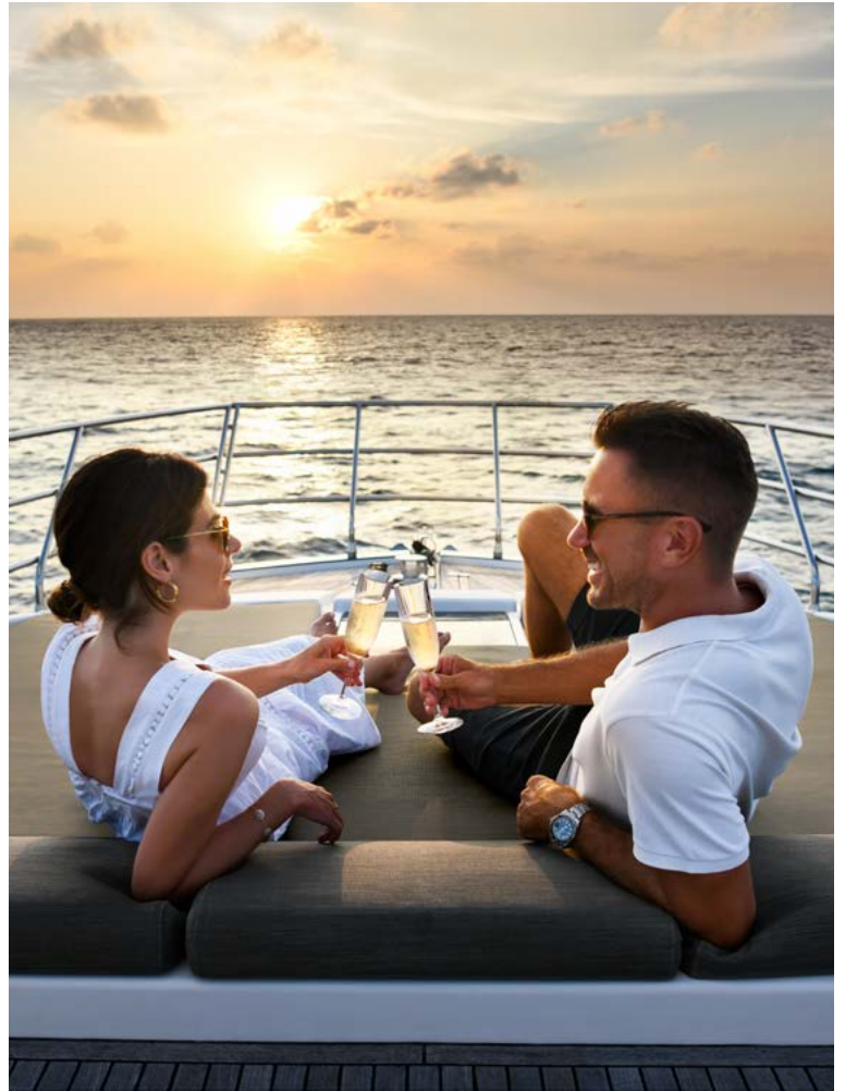
ST. REGIS ANTICIPATES EVERY NEED AND INVIGORATES ALL THE SENSES