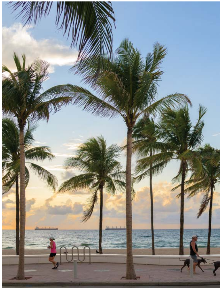
FORT LAUDERDALE OFFERS A BALANCE OF LAID-BACK BEACH LIFESTYLES AND VIBRANT URBAN ACTIVITIES