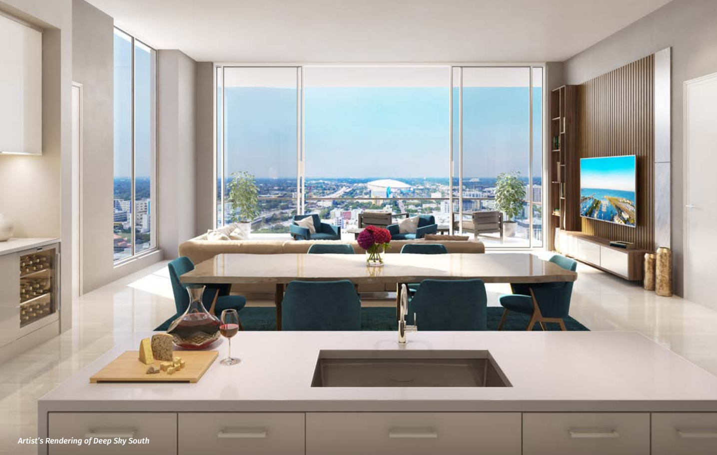
Artist's Rendering of Deep Sky South