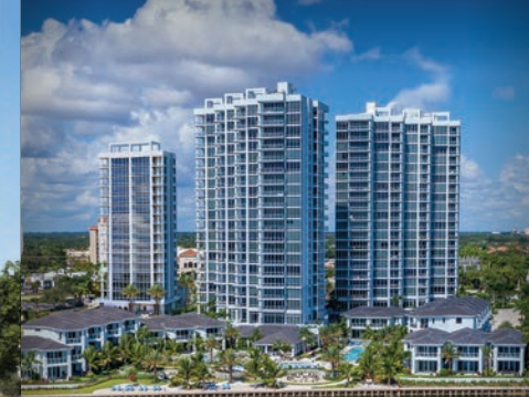
Water Club North Palm Beach