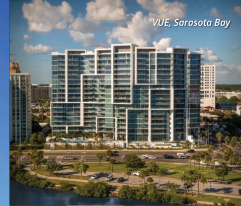
VUE, Sarasota Bay