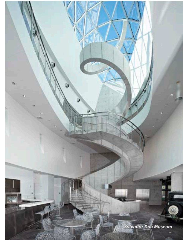
Salvador Dalí Museum