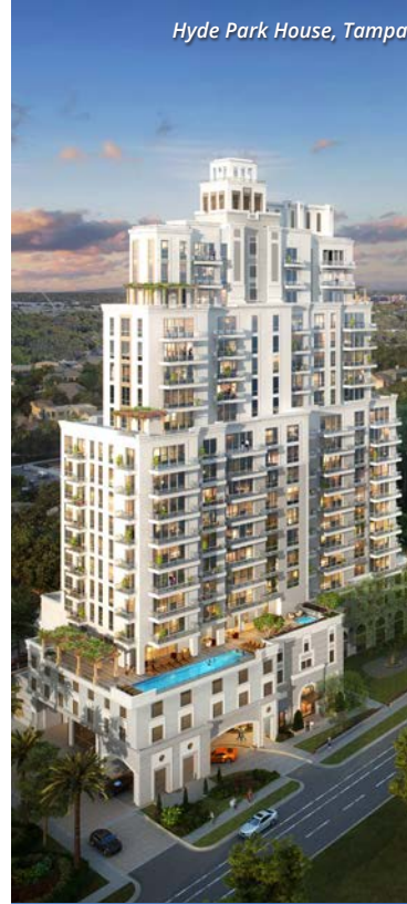
Hyde Park House, Tampa