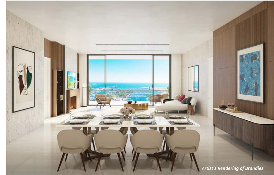
Artist's Rendering of Brandies

A generous selection of designer-coordinated finishes, features, and appliances sets the stage for the unique personalization of every residence.