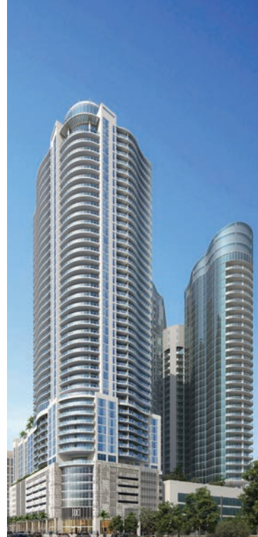
100 Las Olas, Fort Lauderdale