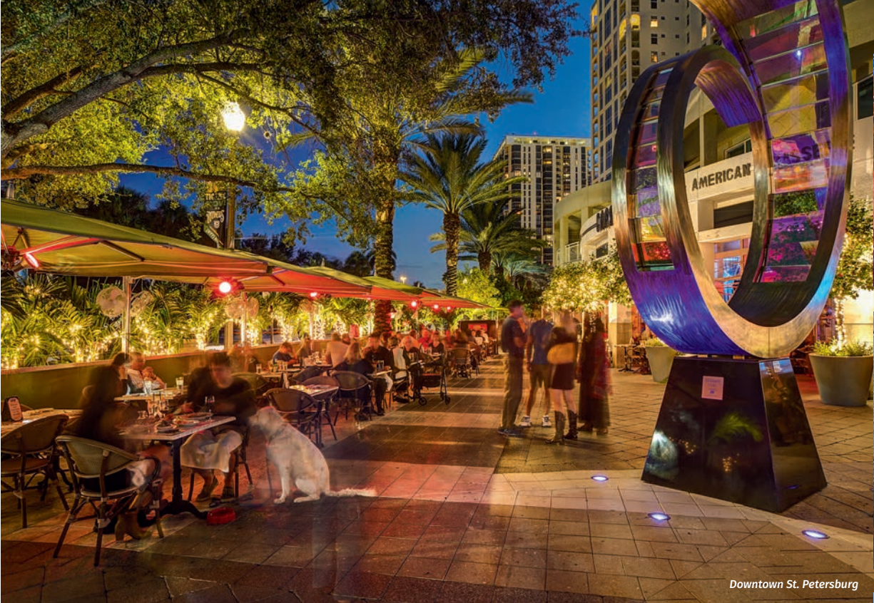
Downtown St. Petersburg