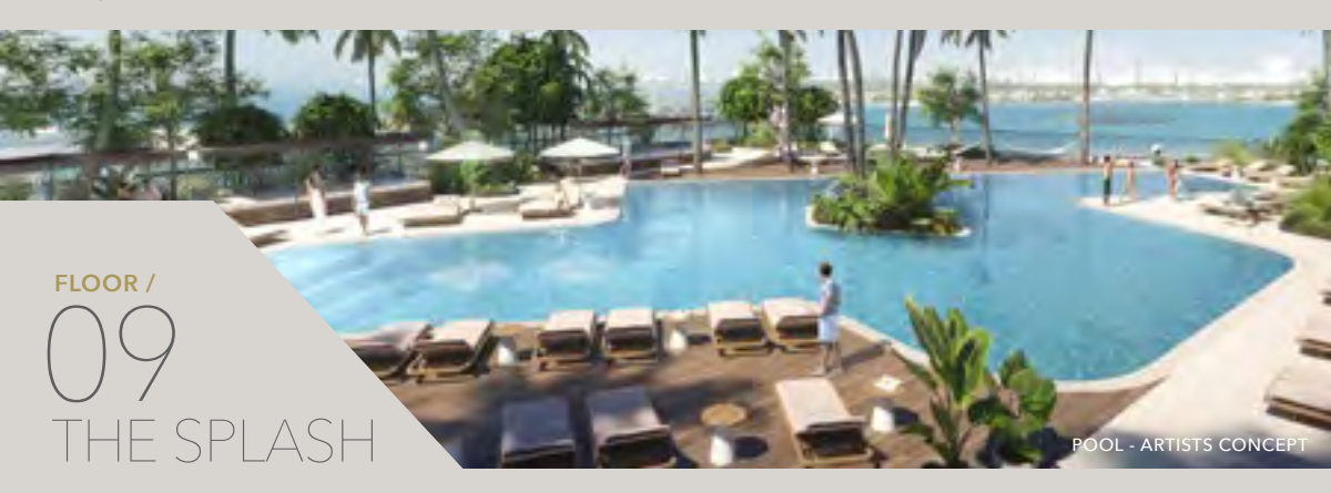
16,000 SQ FT POOLSIDE RETREAT ELEVATED ABOVE THE DOWNTOWN HUM