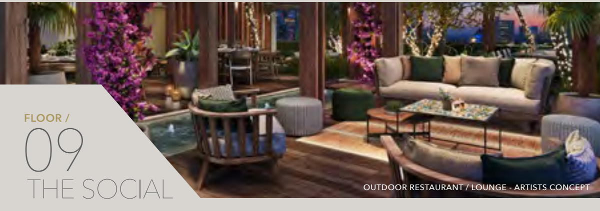
24,000 SQ FT OF INVIGORATING FOOD & BEVERAGE OFFERINGS FOCUSED ON LOCAL FARE

±10,000 SQ FT OF CO-WORKING, CO-IDEATING, CO-MINGLING SPACE